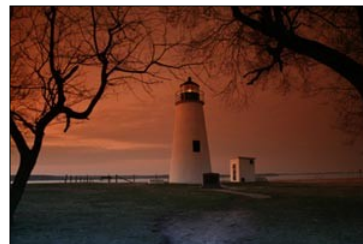
Turkey Point Lighthouse

http://www.dnr.state.md.us/publiclands/central/elkneck.asp