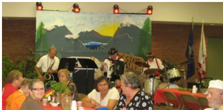
A German band entertained us.

In September the first state rally was Pennsylvania, held at the Lebanon Fairgrounds hosted by the Keystone Unit. Members in attendance were grateful for the hard work and flexibility of the hosts. All were disappointed that the tours had to be cancelled due to closed venues and flooded roads, especially the PA State Police museum.